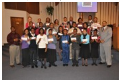
Students with a 3.0 GPA or better received a monetary gift of $25; 4.0 received $50