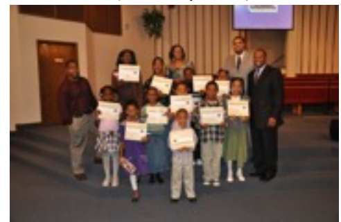
Each student received a certificate.