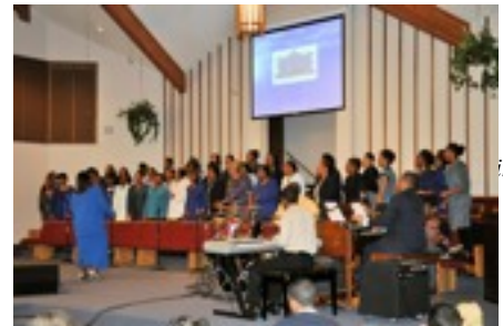
GP Women's Choir singing to the Glory of God